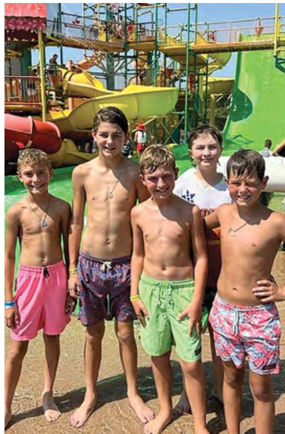
Club 56 had a great time at Hawaiian Falls! Watch the website for the next Club 56 event in September.