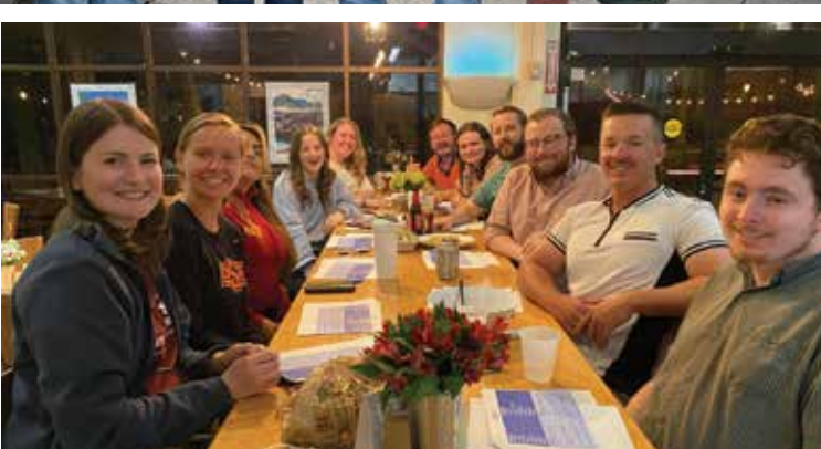
A few of our Young Adults recently participated in the White's Chapel Habitat for Humanity project. The group meets monthly for various activities,