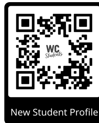
New Student Profile