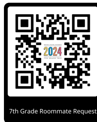
7th Grade Roommate Request