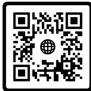
Group Dynamix Waiver